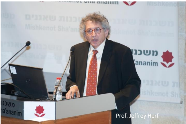
Prof. Jeffrey Herf

The symposium featured three distinct clusters of themes and panels: the historical perspective on terrorism and its connection with political policies in and outside of Germany, the role of various media (news, visual culture, documentary and fictional cinema), and forms of commemorating the terrorist attacks including different outlooks within German collective memory as compared to Israeli commemoration.